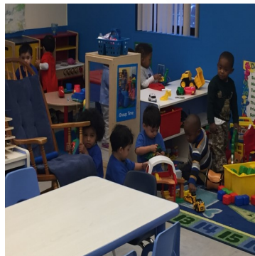
Enroll your child today!