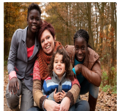
Become a Foster Parent!